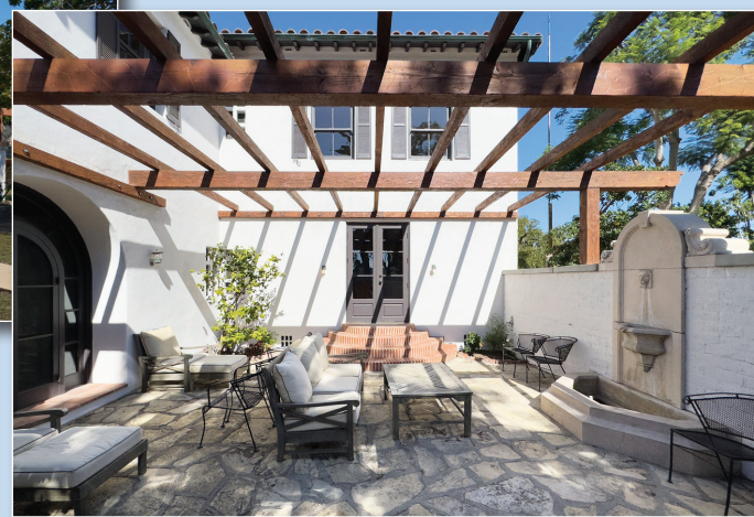
Outdoor pet friendly space.