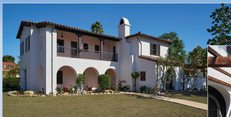
The historic Daily House, located on our premises in Camarillo, has outdoor and indoor space where you can design your service.